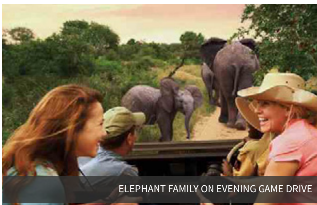
ELEPHANT FAMILY ON EVENING GAME DRIVE